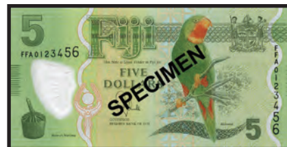
5 DOLLARS 136 x 67mm Issued in April 2013 FJD5.4 Green, yellow and red / Green and brown. Bird (Kulawai) / Crested iguana, Balaka palm and Masiratu flower. Printed on polymer.