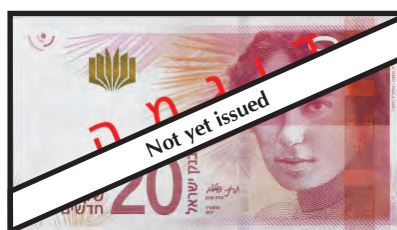
20 NEW SHEQALIM 129 x 71mm To be issued soon ILS20.5

*** Red. Rachel, the Poetess (z"l.) / Vista of the Sea of Galilee and fragment of her poem "Perhaps it was nothing.."