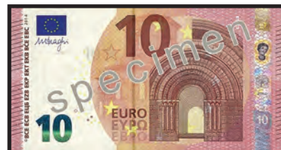
10 EURO Light red, reddish brown and light orange. Gate / Bridge.

127 x 67mm Issued 23 September 2014 EUR10.2