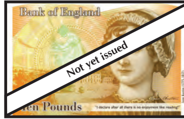
10 POUNDS GBP-BoE10.5 A new note printed on polymer substrate honoring Jane Austen is being planned for release in the September 2017. This picture shows a fragment of the back of the note. Future