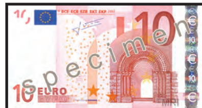
10 EURO Red and multicolor. Window / Bridge in Romanesque style.