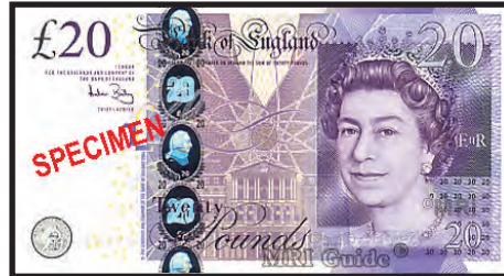
20 POUNDS 150 x 80mm Issued 13 March 2007 GBP-BoE20.4 2006 Violet / Violet and orange red. Elizabeth II / Adam Smith.