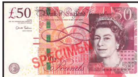
50 POUNDS Series F 156 x 85mm Issued 11 February 2011 GBP-BoE50.3 ©2010 Red and multicolor. Elizabeth II / Matthew Boulton and James Watt.