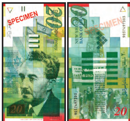
20 NEW SHEQALIM 71 x 138mm Issued 3 January 1999 ILS20.2 1998-2014 Green and multicolor. Moshe Sharet (z"l.) and flag / Raising of the Israeli flag in the United Nations in New York. Printed on paper.