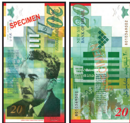
20 NEW SHEQALIM 71 x 138mm ILS20.3

Older Government notes as well as those of Barclays Bank Ltd., Isle of Man Bank Ltd., Lloyds Bank Ltd., Martins Bank Ltd and Westminster Bank Ltd. are redeemable. However their collectors value is higher. Ten shillings equal 0.50 pound.