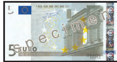
5 EURO Purple brown and olive. Window / Bridge in Classical style.