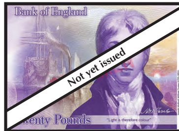
20 POUNDS GBP-BoE20.5 A new polymer note honoring J.M./ W. Turner is being planned for release in 2020. This picture shows a fragment of the back of the note. Notyet Future