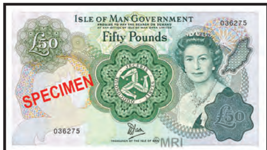
50 POUNDS 170 x 95mm IOM50.1 Blue and green. Elizabeth II / Douglas Bay.