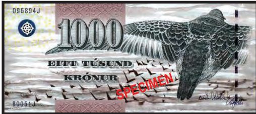
1,000 KRÓNUR 165 x 72mm Issued 15 September 2005 FAK1,000.2 (20)02 Slate, lilac brown and multicolor. Purple sandpiper / View of the island of Sandoy. VARIETIES: FAK1,000.2A 2001 Narrow segmented security thread. FAK1,000.2B 2011 With a "see through" seal and wide segmented security thread.