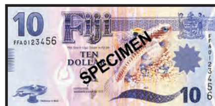
10 DOLLARS 141 x 67mm Issued 2 January 2013 FJD10.4 Purple / Purple, green and violet blue. Fish (Beli) / Joske's thumb and Grand Pacific Hotel.