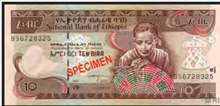
10 BIRR 1997- Brown, red, green and multicolor. Woman / Tractor.