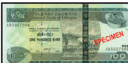
100 BIRR 2003- Deep green and multicolor. Farmer plowing / Man with microscope and Stele of Axum.