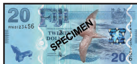
20 DOLLARS 146 x 67mm Issued 2 January 2013 FJD20.4 Blue and light brown / Blue and multicolor. Bird (kacau ni Gau) / Logging and mining.