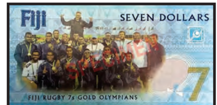
7 DOLLARS 136 x 67mm Issued 21 April 2017 FJD7.1 *** Blue and multicolor. Rugby player/ Fiji's 2016 Rio Olympic Gold Medal team. Commemorative of Gold Medal won by Fiji's team at 2016 Rio Olympics.