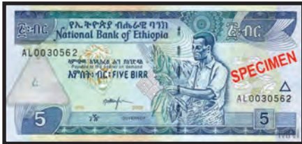
5 BIRR 1997- Blue and multicolor. Man harvesting coffee / Kudu and leopard.

Smaller notes of 1 birr not listed because of low value.