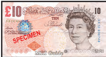
10 POUNDS 142 x 75mm Issued 7 November 2000 GBP-BoE10.4 Dark violet, orange brown and multicolor. Elizabeth II / Charles Darwin. VARIETIES: GBP-BoE10.4A "... and the Company..." GBP-BoE10.4B "... and Company..."