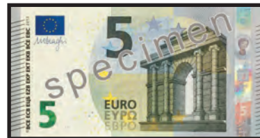
5 EURO Light purplish gray and yellow. Window / Aqueduct.