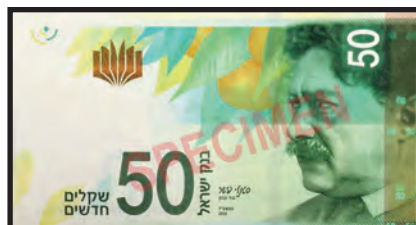
50 SHEQALIM 136 x 71mm Issued in September 2014 ILS50.3 Green. Shaul Tchernichovsky (z"l.) / Value.

1999-2007 Violet and multicolor. Shmuel Yosef Agnon (z"l.) / Agnon's writing stand, glasses and pen and aerial view of Jerusalem.