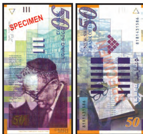
50 NEW SHEQALIM 71 x 138mm Issued 31 October 1999 ILS50.2

1999-2007 Violet and multicolor. Shmuel Yosef Agnon (z"l.) / Agnon's writing stand, glasses and pen and aerial view of Jerusalem.