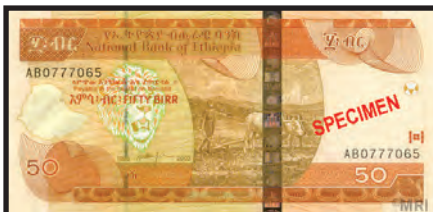
50 BIRR 2003- Yellowish orange and multicolor. Farmer plowing / Castle of Gondar.