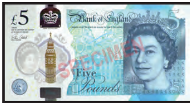
5 POUNDS 125 x 65mm Issued 13 Sep 2016 GBP-BoE5.6 Blue. Elizabeth II / Sir Winston Churchill. Printed on polymer.